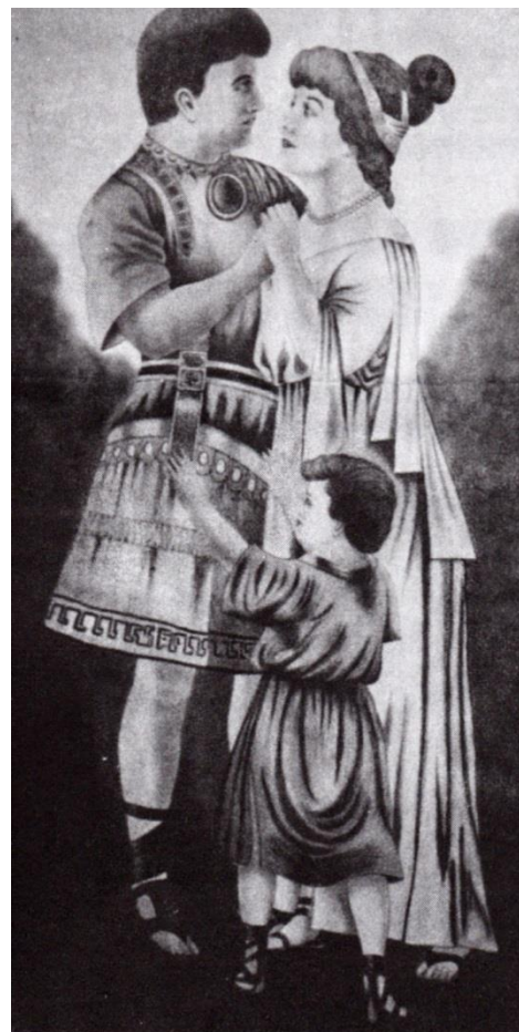
Damon's Farewell to his family

Some of the Knights' benevolent activities included maintaining homes and/or hospitalization for the aged and infirm, camps for underprivileged children, educational opportunities for deserving students, and supporting tuberculosis foundations.